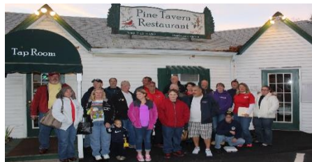
Above: Pine Tavern Restaurant in Floyd, VA Below: Cruise Line-Up November 8 th , 2015